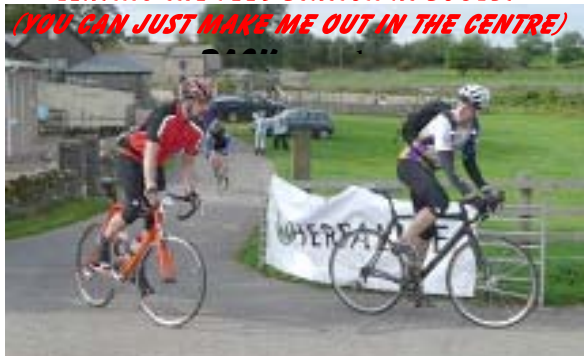
"LEAVING THE FEED STATION AT SOULBY" (YOU CAN JUST MAKE ME OUT IN THE CENTRE)

This passes Dent Station (which is a good 5 miles from Dent village and also 600ft higher!) and continues climbing for another 600ft to the summit at 1800ft. The view into the next valley opened up in front of me as I changed up through the gears and settled into the drops for the plummet back down to the main road. The speedo was hovering round the 40mph mark and by the time the final 1 in 4 downhill corner loomed, I could smell the brakes. Once in Garsdale Head, Kirkby Stephen is only 5 miles away via the main road but we took the scenic route heading east then turning onto the back roads to take in the infamous Buttertubs Pass. This beautiful road is truly remote but at 1 in 6, the gradient was harsh enough to focus attention more on turning the pedals than the stunning scenery unfolding around us. At the 1750ft summit, the road literally