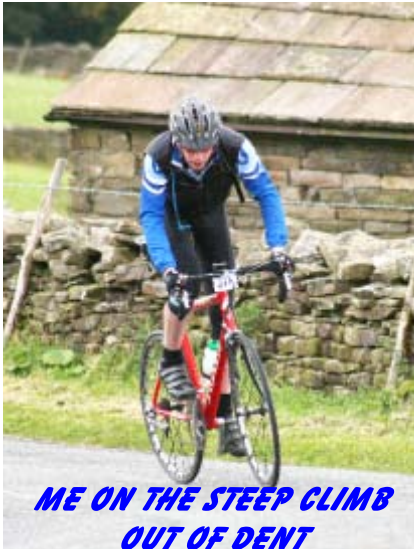
ME ON THE STEEP CLIMB OUT OF DENT

It wasn't long before I left them behind and continued mostly on my own out across the familiar roads of Lancashire, across the M6 and then starting the climb out of Kirkby Lonsdale across the beautiful Barbondale. This narrow road climbs gradually alongside a bubbling stream as the terrain becomes more typically Yorkshire with its drystone walls, limestone outcrops and rounded hills. There was a rapid drop into the lovely village of Dent with the welcome sight of a feed station at the 30-mile mark.