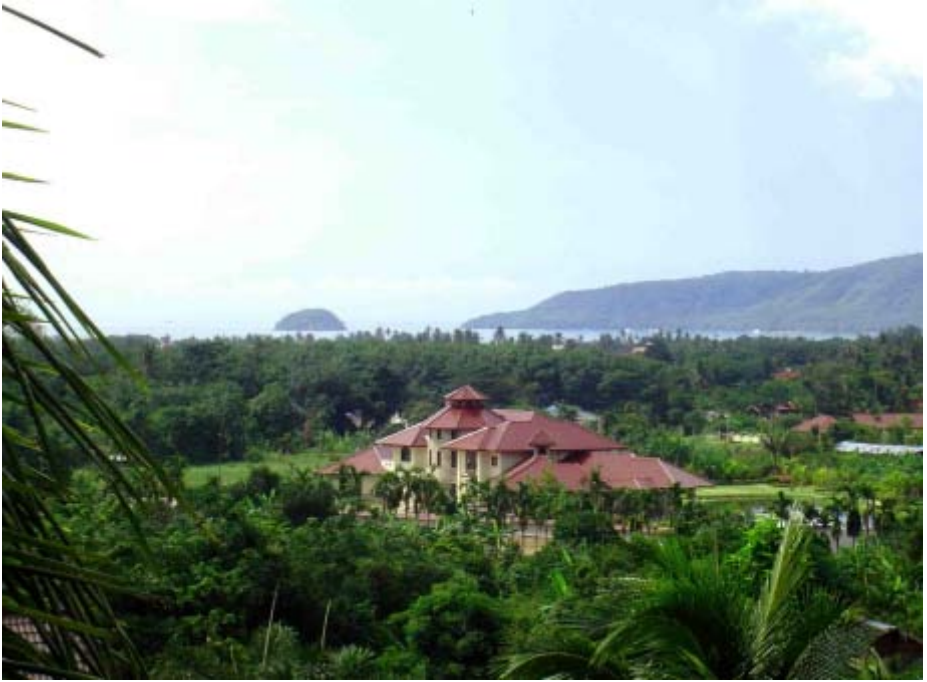
101 House from Skeggs