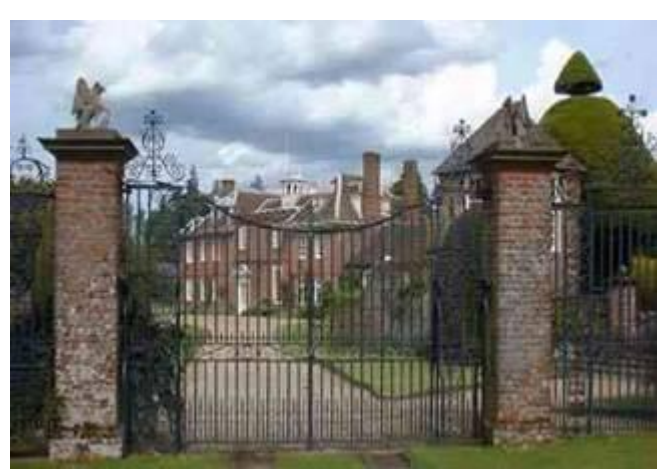
Sharsted Court May 2000

The origins of the ancient Manor of Sharsted date back too far to be accurately ascertained; there has undoubtedly been a house on the site since 1080, but it is unlikely that there exist any remains of the original.