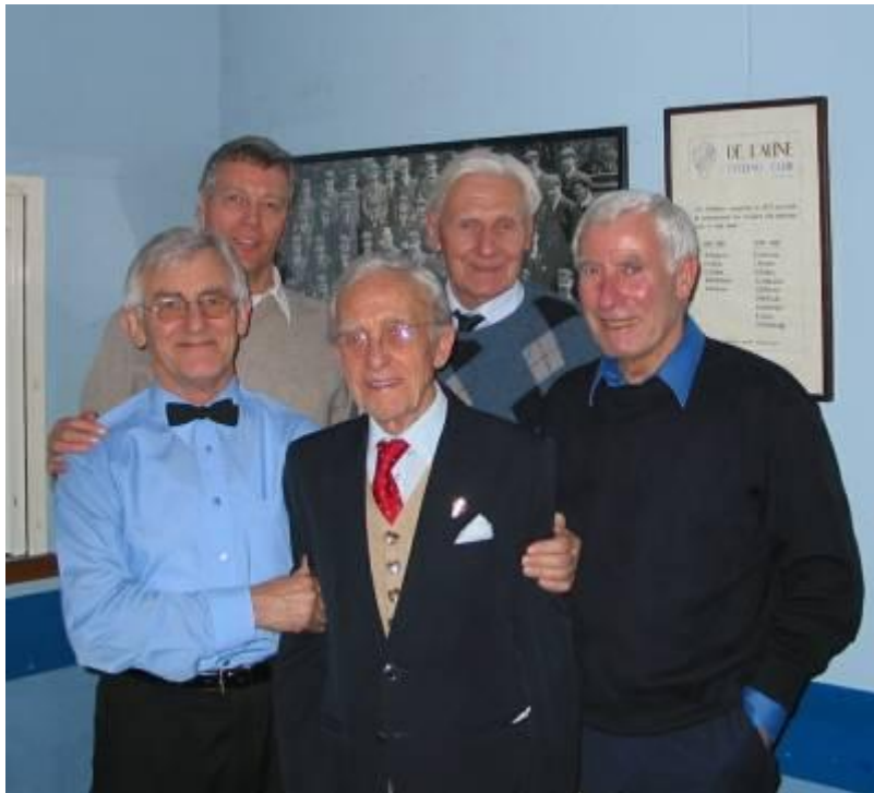
Past & Present