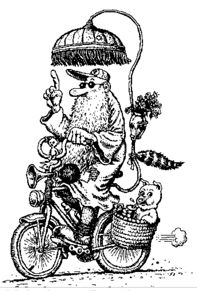
Could this be our President out on a training ride in Tatsfield